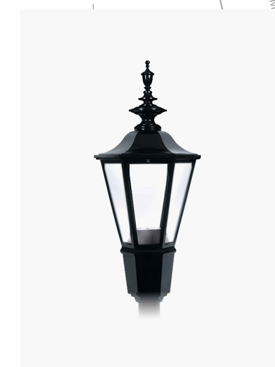
DECORATIVE POST TOP ACCENT LIGHT (N.T.S)