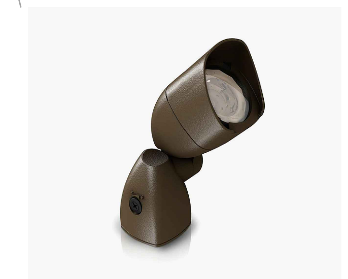
LED LANDSCAPE TREE UPLIGHT (N.T.S)