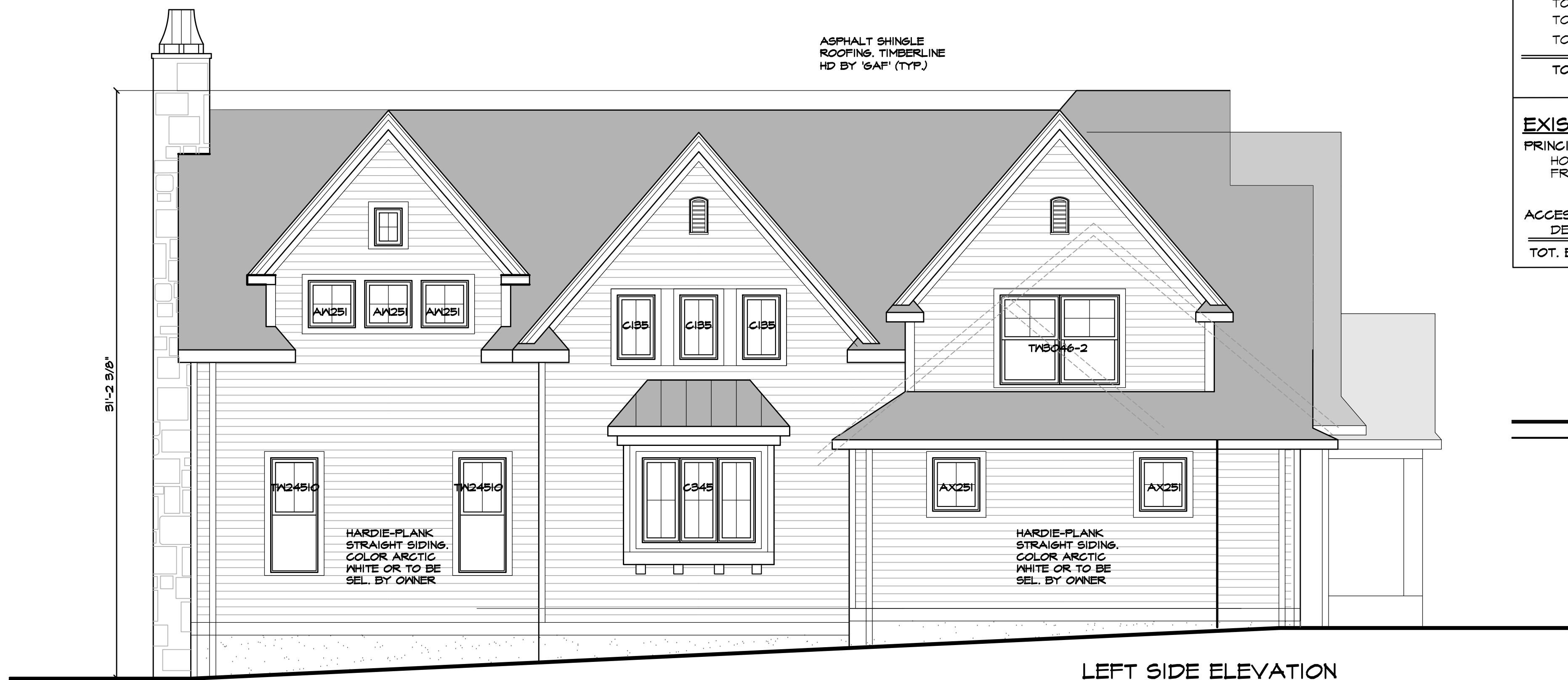
LEFT SIDE ELEVATION SCALE: 1/4" = 1'-0"