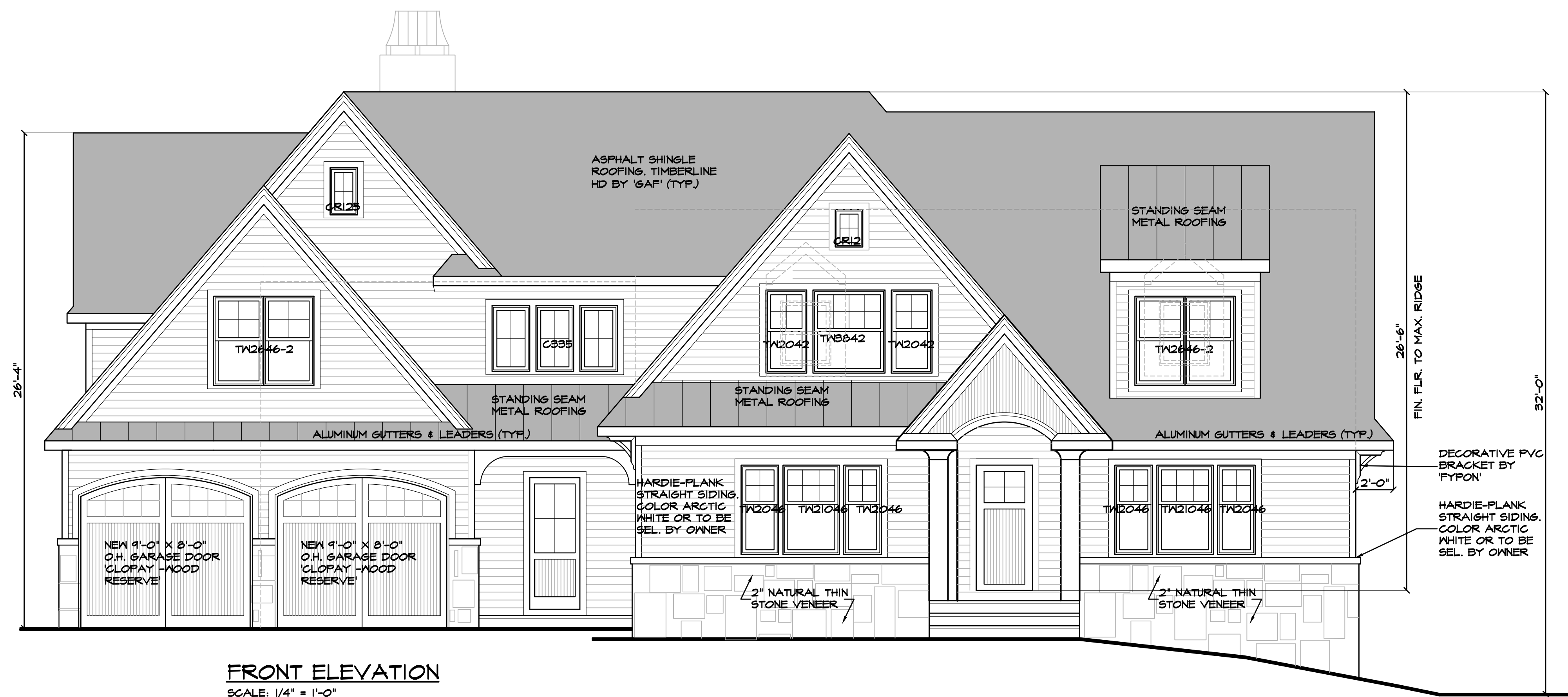
FRONT ELEVATION SCALE: 1/4" = 1'-0"