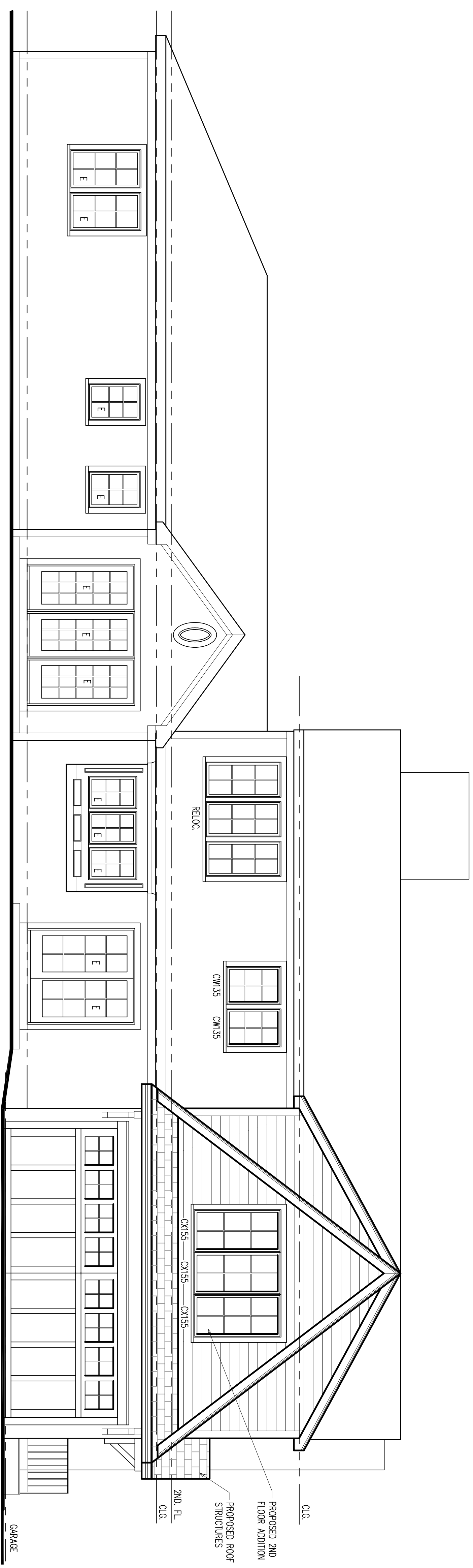
1 PROPOSED REAR ELEVATION SCALE: 1/4" = 1'-0"