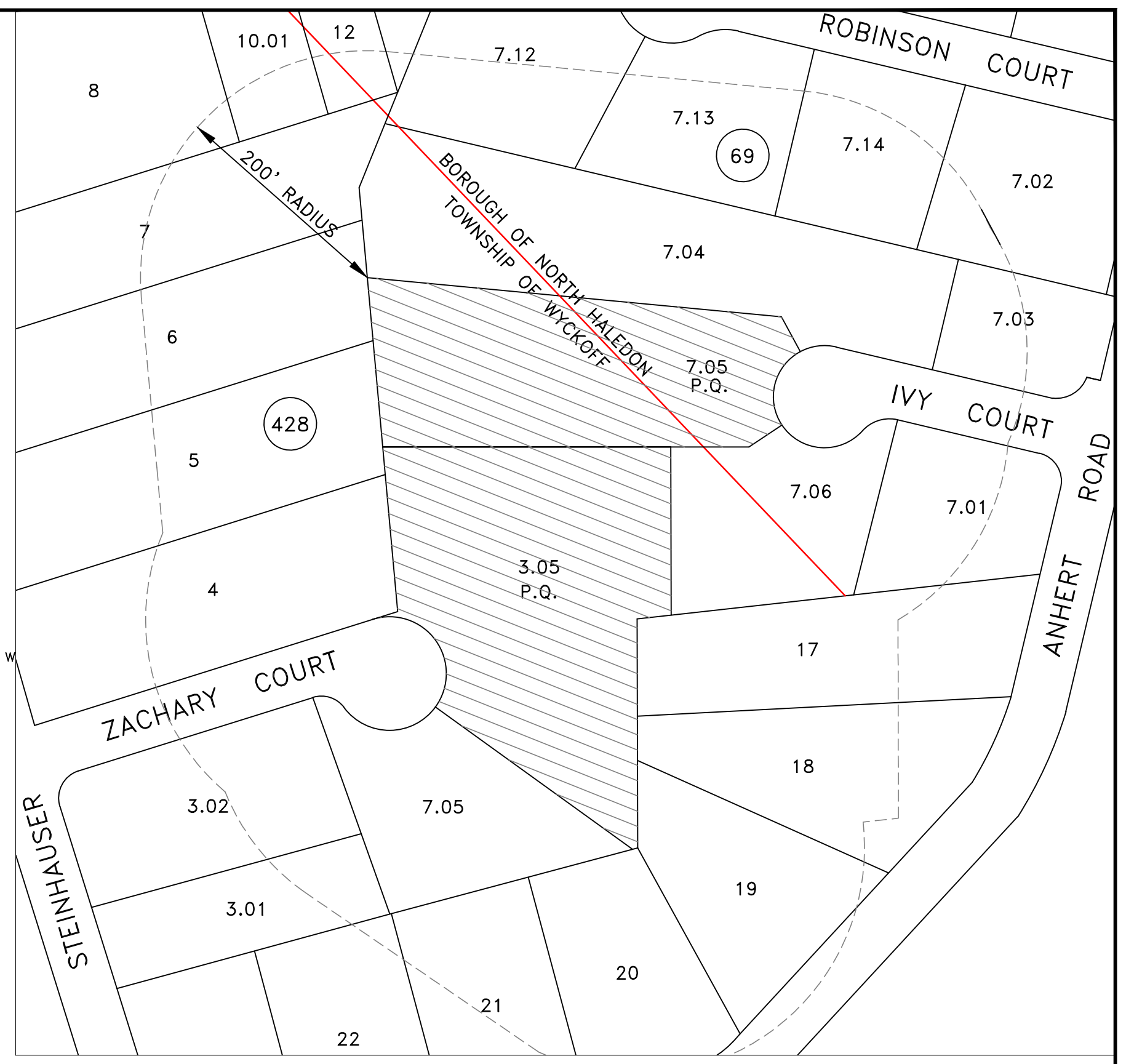
KEY MAP SCALE: 1"=100'