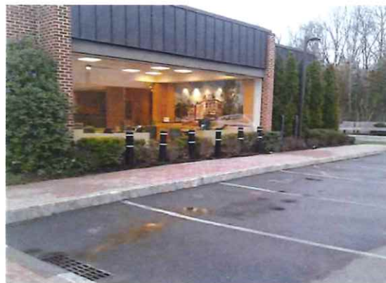
BOLLARD - LEVEL 2