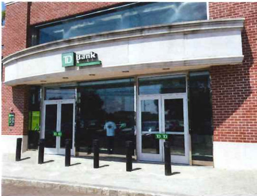
BOLLARD - LEVEL 1