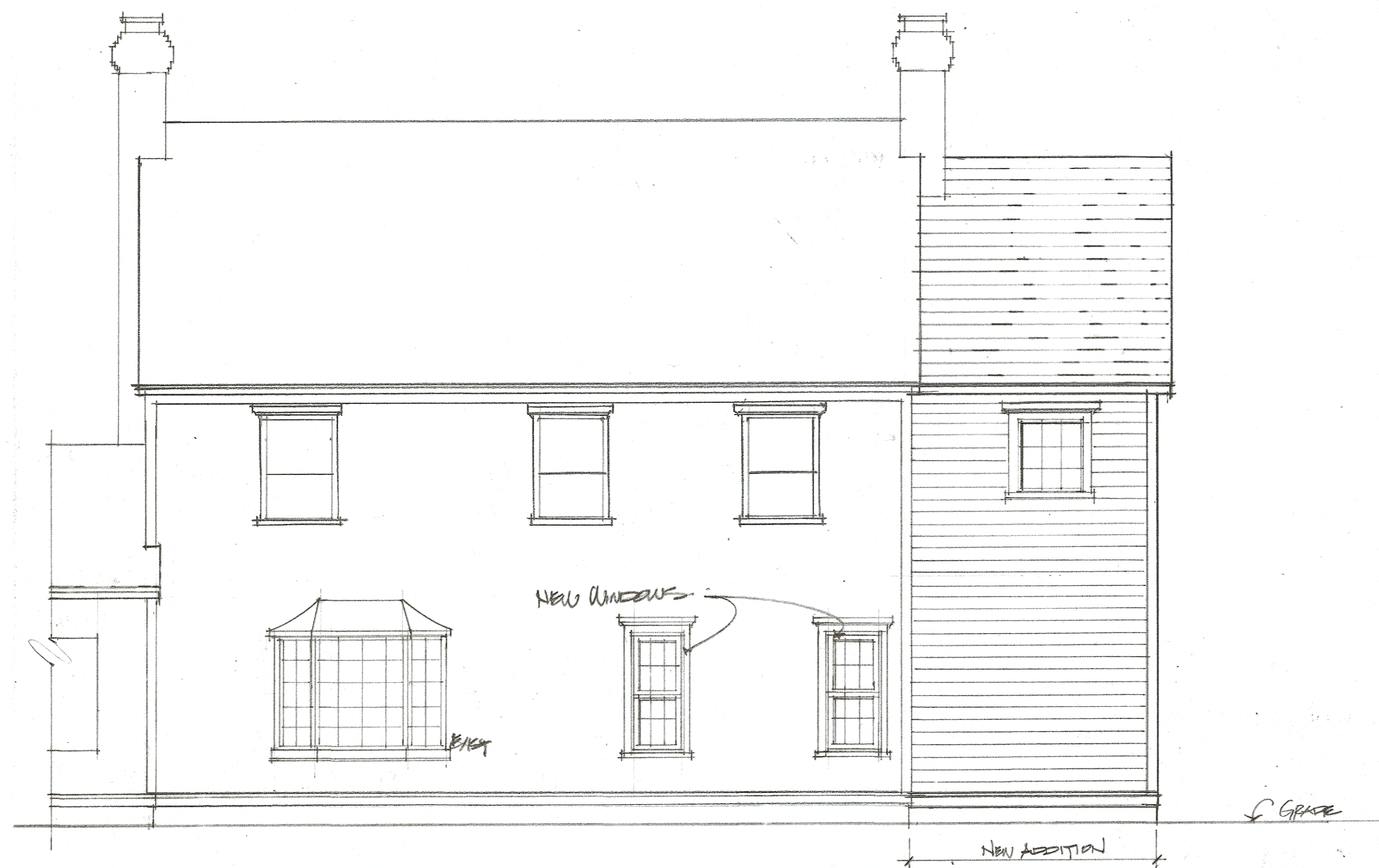
REAR ELEVATION SCALE: 1/4" = 1'-0" 11.0.20