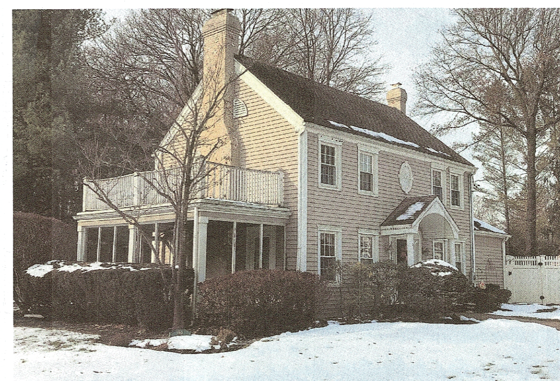
EXISTING FRONT & SIDE ELEVATION