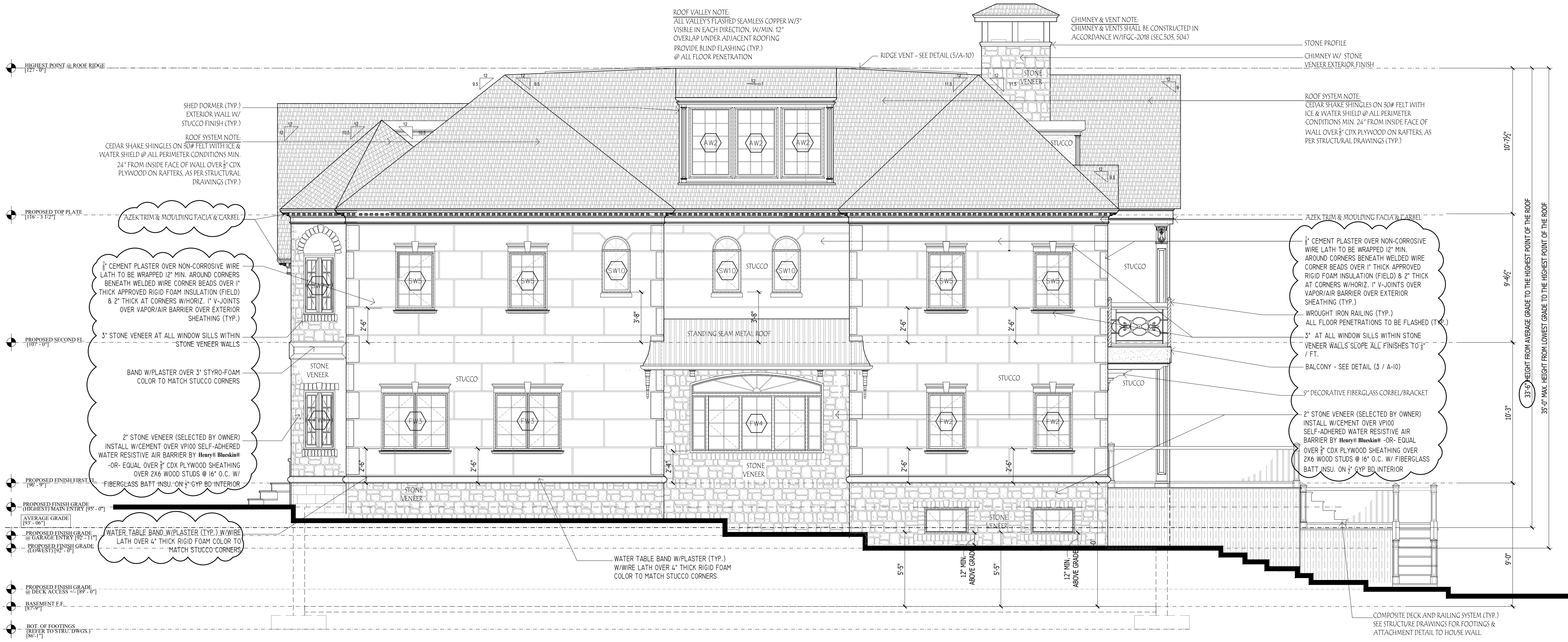
2 RIGHT SIDE ELEVATION A-06 SCALE: 1/4" = 1'-0"