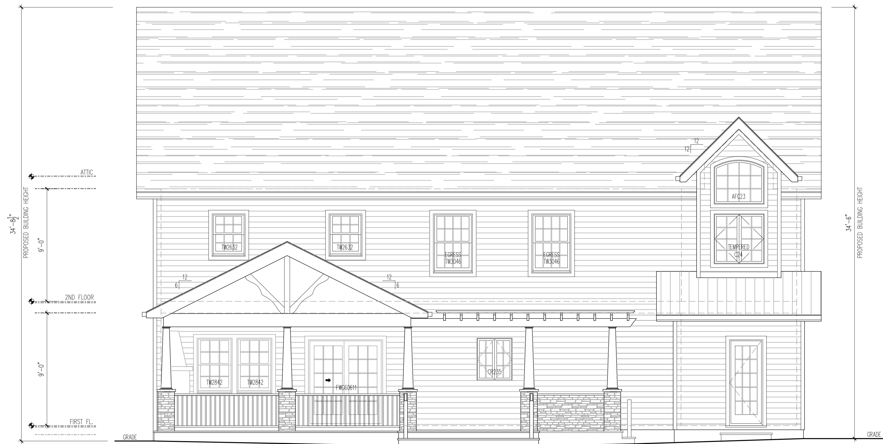
1 PROPOSED SOUTH ELEVATION