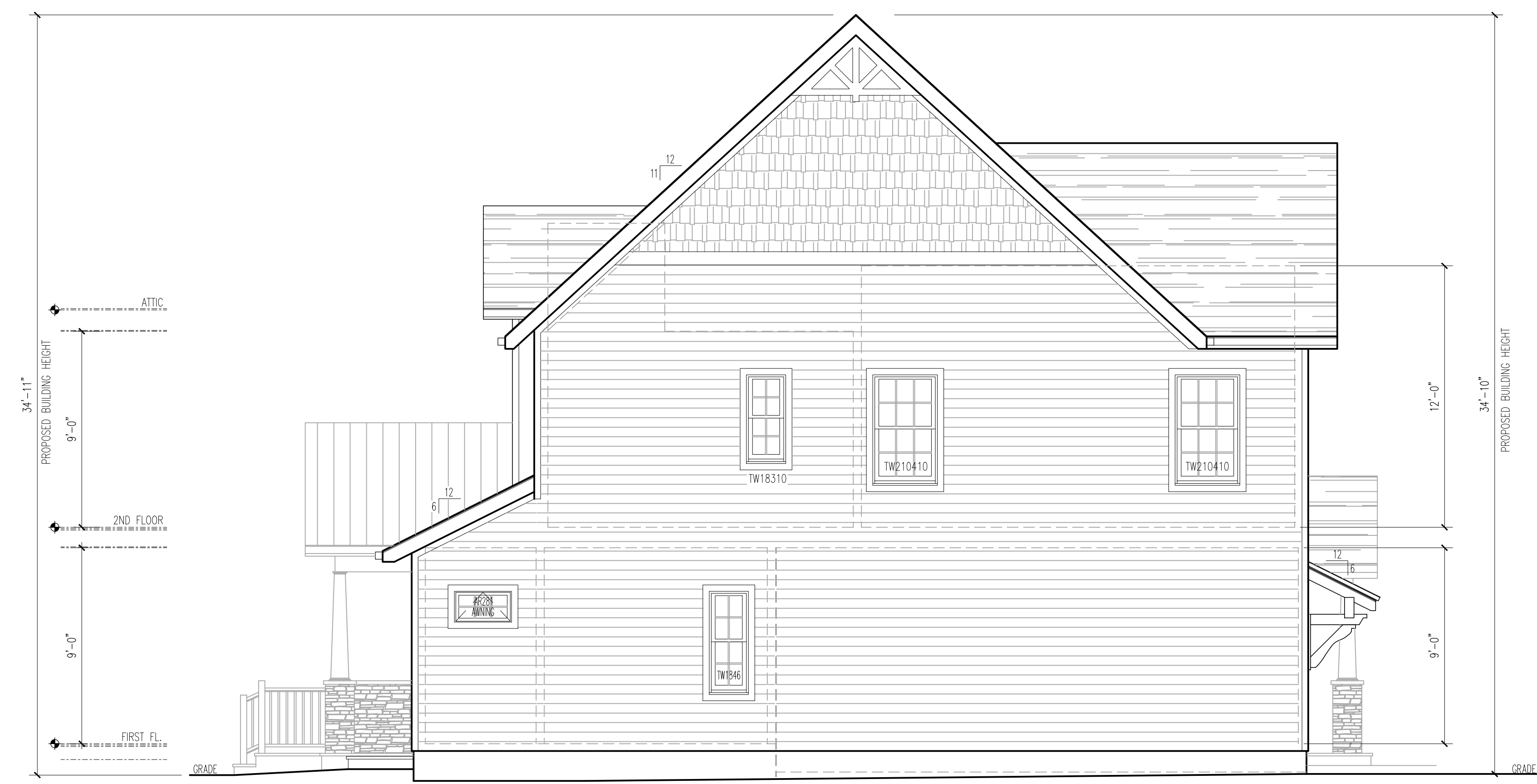
2 PROPOSED WEST ELEVATION